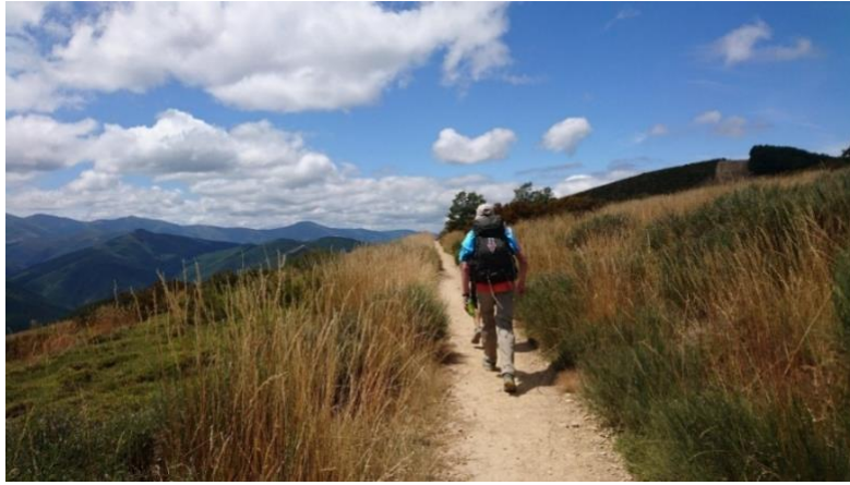
Image: Pilgrims on the trail near Manjarin, Camino Frances