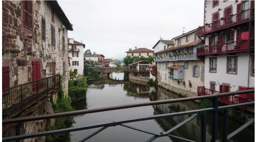
Image: St Jean Pied de Port, France.

This book is also available as an e-book which would be more practical to carry as the paperback is weighty. Although rather dated it carries a wealth of interesting historical and architectural information about the Camino Frances. (This is a reference book, not a guide.)